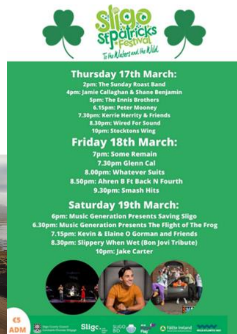
Screenshot from Sligo: Live Invest Visit online video – “Visit Sligo”, and the St Patrick's Day 2022 festival poster.