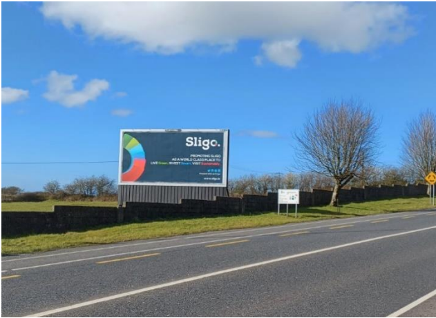
Sligo. brand billboard Pearse Rd route into Sligo Town