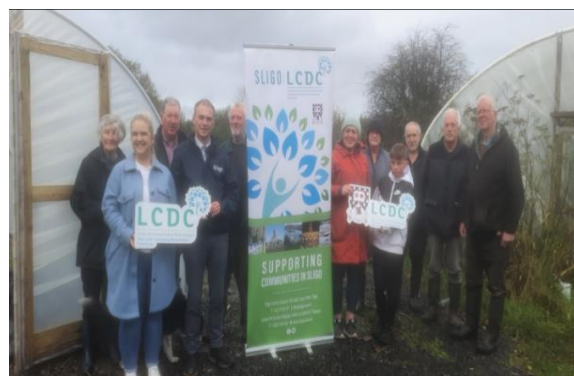
Men's Shed visit – Geevagh Mens Shed