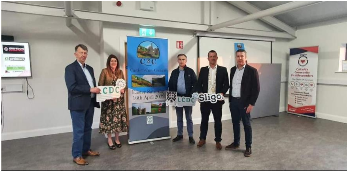
Castle to Cave Camino – Funded under the Transitional LEADER Programme 2021-2022 – 16 th April 2022

As the current Rural Development Programme and Transitional LEADER Programmes come to an end, 2023 will see the commencement of a new LEADER Programme 2023-2027. On 27 th October, 2022 Minister for Rural and Community Development, Heather Humphreys TD, announced the details of the €180 million LEADER Programme for 2023-2027. The 2023-2027 LEADER funding allocation for Sligo has been set at €6.1 million.