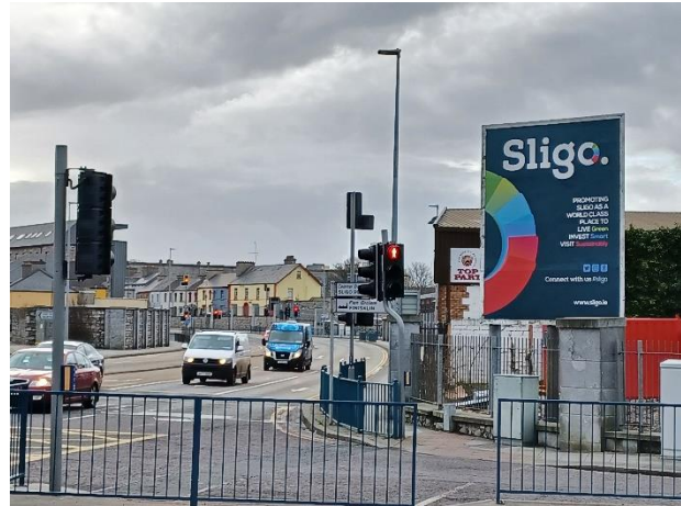
Sligo. brand sign on Hughes Bridge

The second Sligo. brand video released during 2022 promotes the Invest pillar of the Sligo. brand and was launched on Wednesday 29th June on Sligo.ie and partner social media channels.