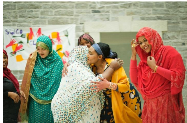
Participants at the Sligo Africa Day Celebrations 2022

Sligo Africa Day 2022 was hosted at The Model, Sligo. The event was a celebration and showcase of African food, fashion, craft, music and dance, of the Sligo African Community. An evening of fun workshops on singing, hair-braiding, and film, culminated with an address by the Cathaoirleach of Sligo County Council, food from Sligo Global Kitchen and musical entertainment.