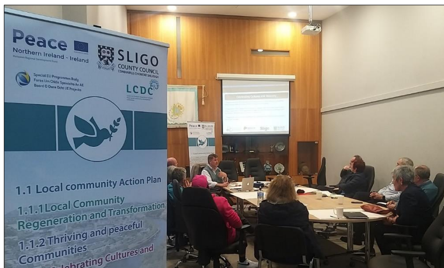
Working on the Co-designed Local Community Peace Action Plan, in Tech Laignhe, Tubbercurry.

During 2022, the establishment of the Sligo PEACEPLUS Partnership, and tendering for external expertise to support and facilitate development of the Action Plan formed the focus of work. Appointment of a staff member with responsibility for PEACEPLUS in Sligo and reporting to the LCDC took place in October 2023. The official call for applications from SEUPB with accompanying funding criteria detail was postponed until 2023.