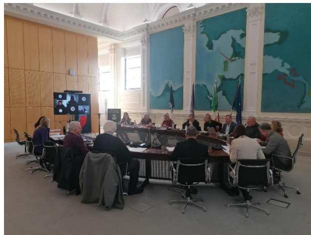
LCDC/LAG Meeting in progress