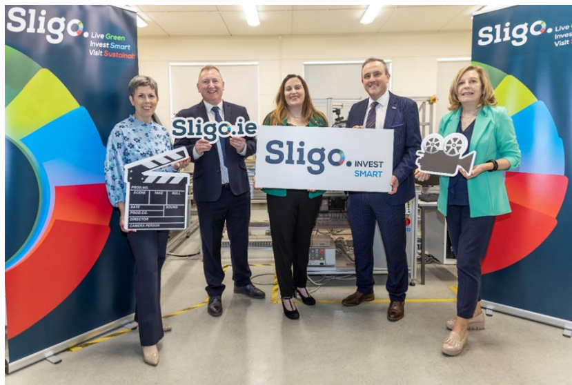
"Why not make Sligo yours?" video launch in ATU, Sligo

The second Sligo. brand video released during 2022 promotes the Invest pillar of the Sligo. brand and was launched on Wednesday 29th June on Sligo.ie and partner social media channels.