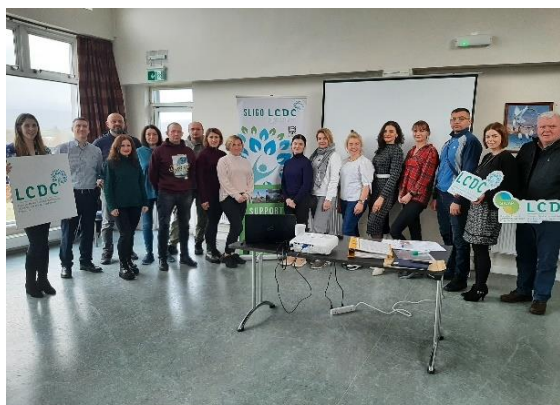
Ukrainian Start Your Own Business Course – Northside Sligo

Some samples below of SICAP collaborative projects in 2022: